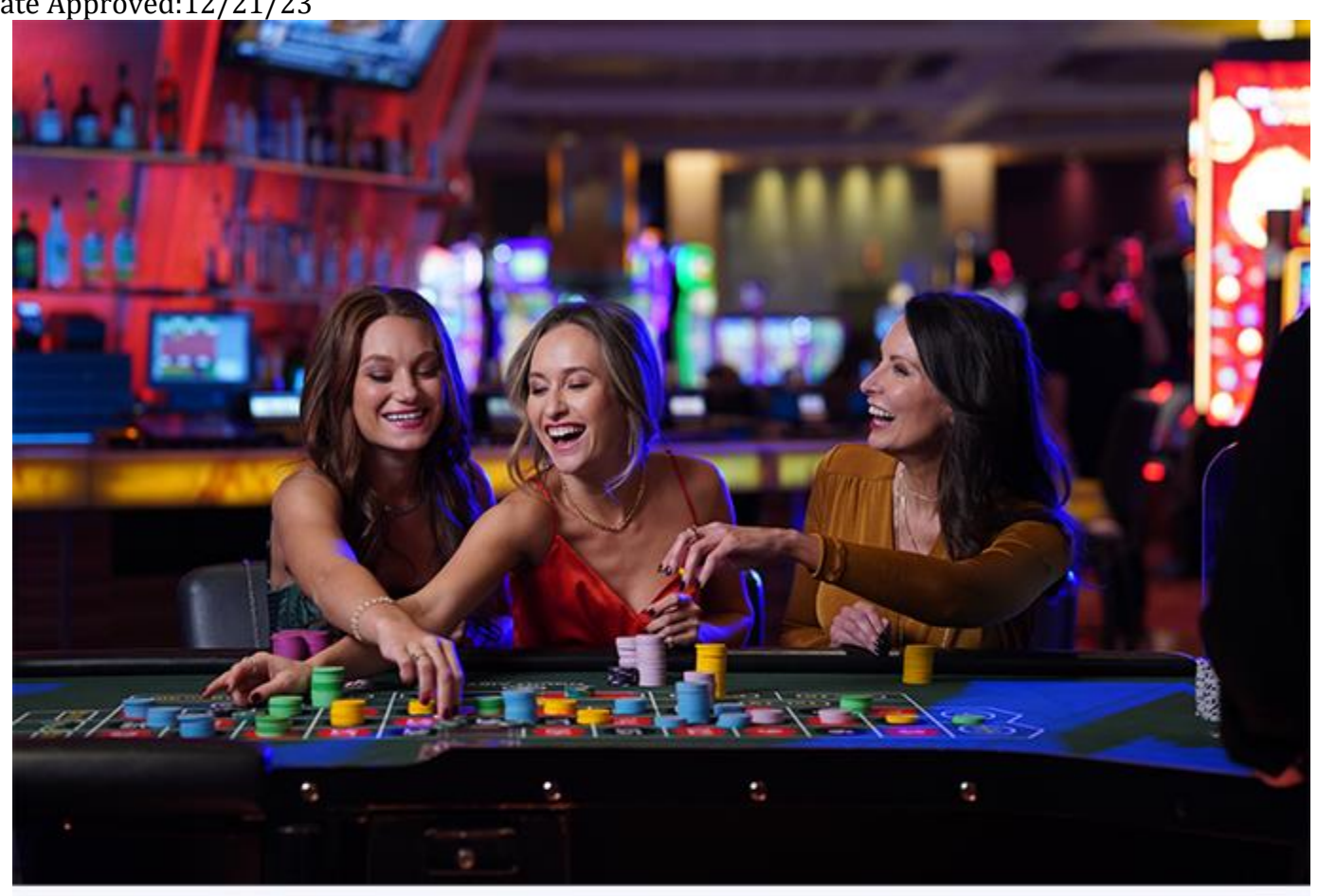
TABLE GAME GUIDE